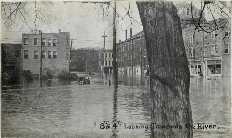
8 TH & 4 TH Looking Towards the River.