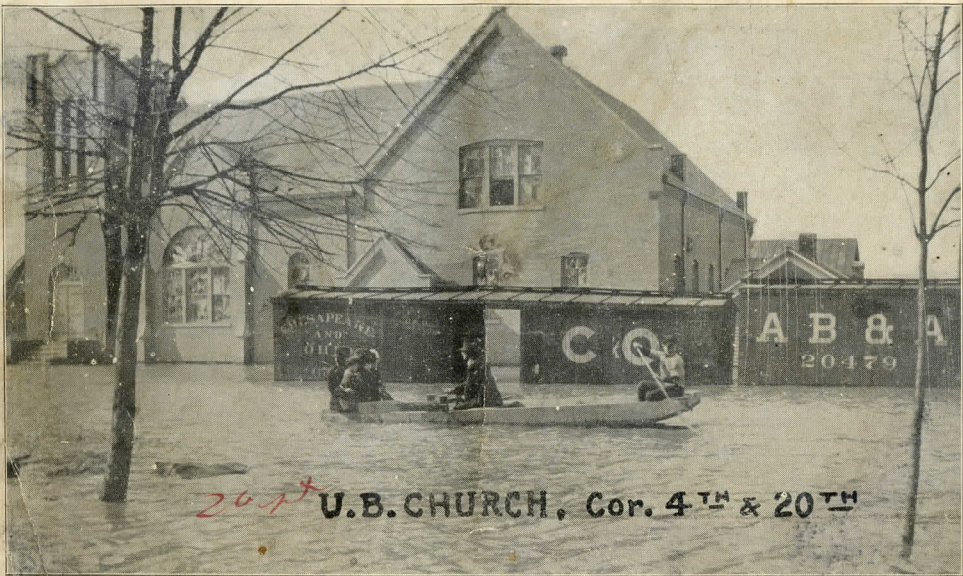
20th U.B. CHURCH, Cor. 4 TH & 20 TH