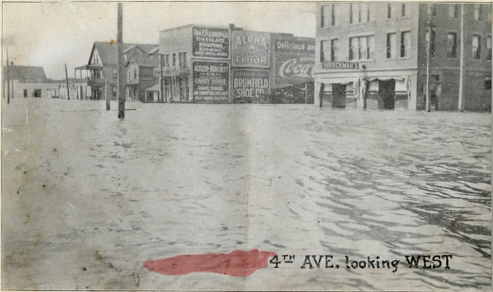
4 TH AVE. looking WEST