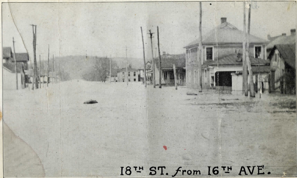
18 TH ST. from 16 TH AVE.