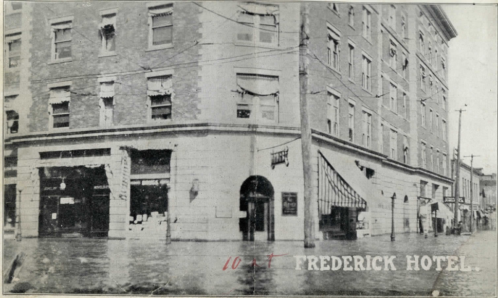
10 ST FREDERICK HOTEL.