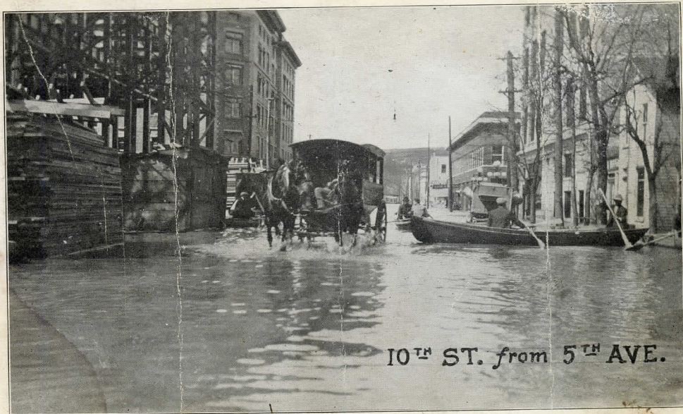
10 TH ST. from 5 TH AVE.