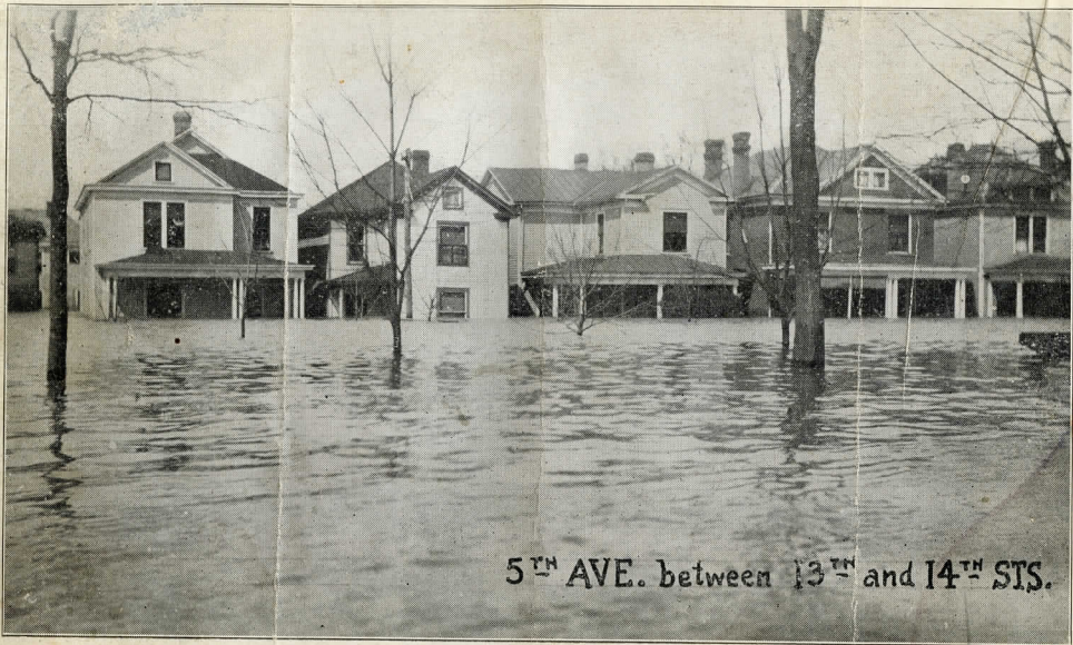
5 TH AVE. between 13 TH and 14 TH STS.