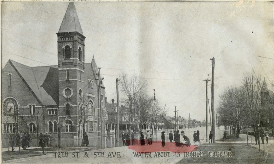
12 TH ST. & 5 TH AVE. WATER ABOUT 15 INCHES HIGHER