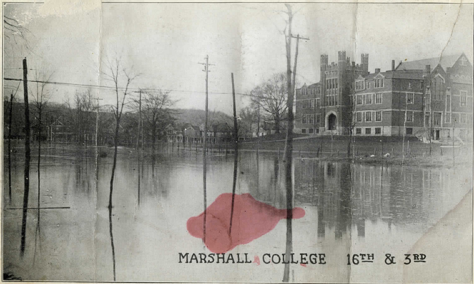
MARSHALL COLLEGE 16 TH & 3 RD