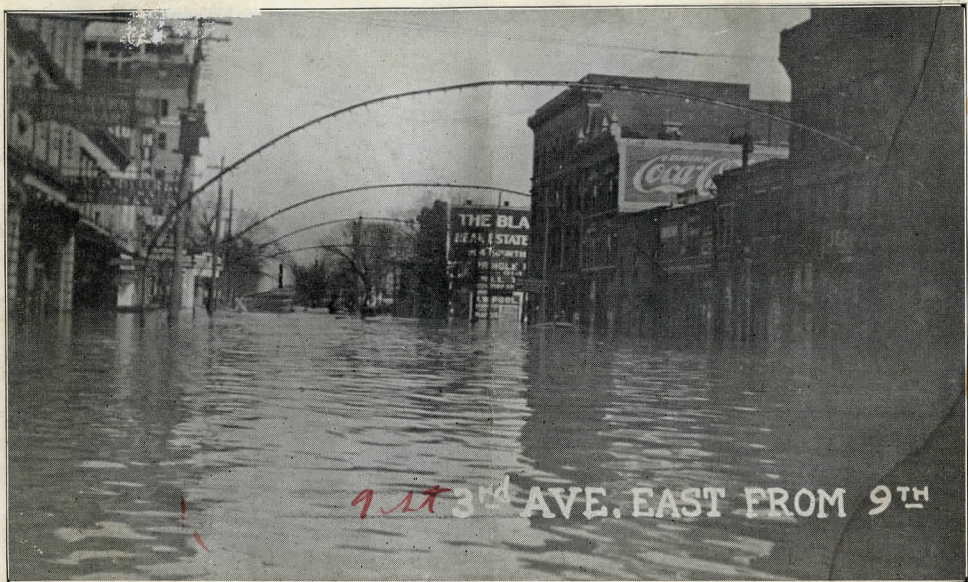
9 th 3 rd AVE. EAST FROM 9 th