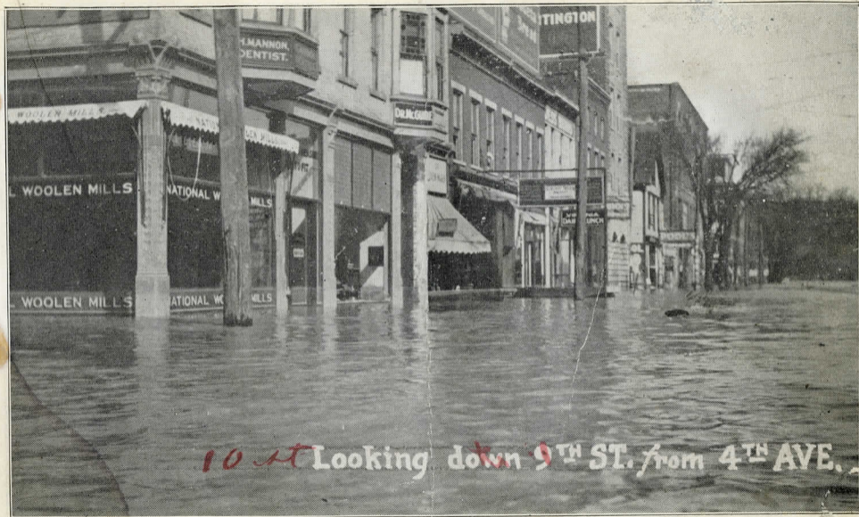
10 St Looking down 9 TH ST. from 4 TH AVE.