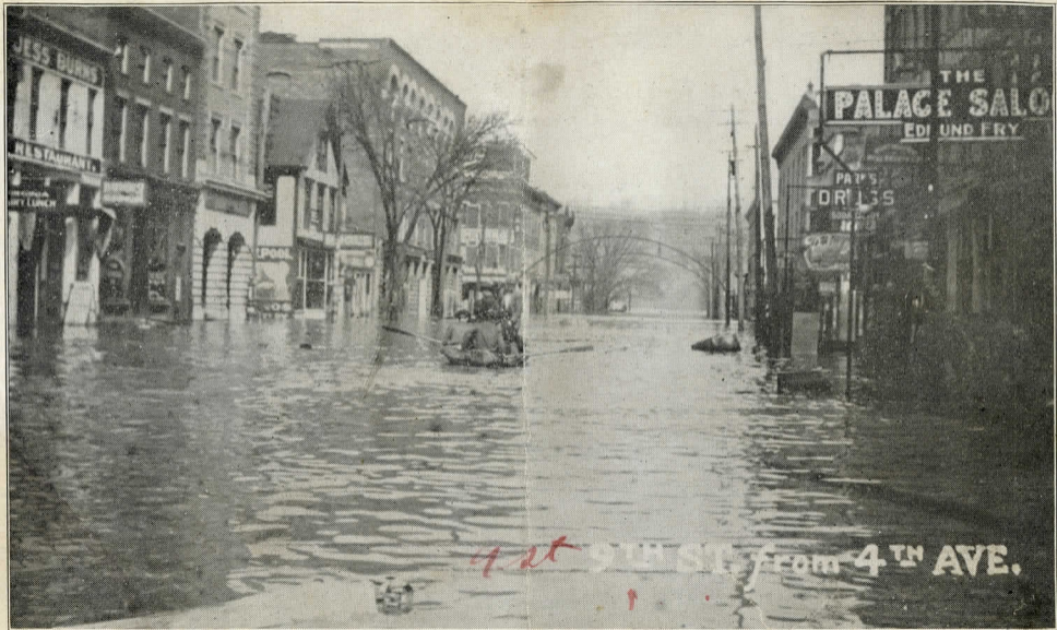
4th 9th St from 4th Ave.